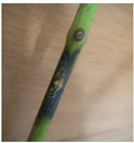
Fig 1. Symptoms of bacterial canker caused by Brenneria nigrifluens on walnut ( Juglans regia ) young twigs one month after inoculation.